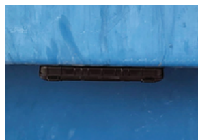
AssetTrac TM Installed on asset